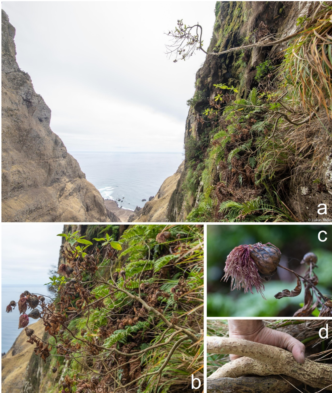
FIGURE 4. (a) C. schilleri in natural habitat at “El Tongo” ravine; (b) detail of a specimen; (c) branch with mature capitulum; (d) bark. Photographs by Lukas Mekis. / (a) C. schilleri en su hábitat natural en la quebrada “El Tongo”; (b) detalle de un ejemplar; (c) rama con capítulo maduro (d) corteza. Fotografías de Lukas Mekis.

(Molina) Gunckel, Peperomia berteriana Miq., Gaultheria racemulosa (DC.) D.J. Middleton, Blechnum chilense (Kaulf.) Mett., Polystichum tetragonum Fée, and Gunnera masafueriae Skottsbo. The nomenclature follows Rodríguez et al. (2018).