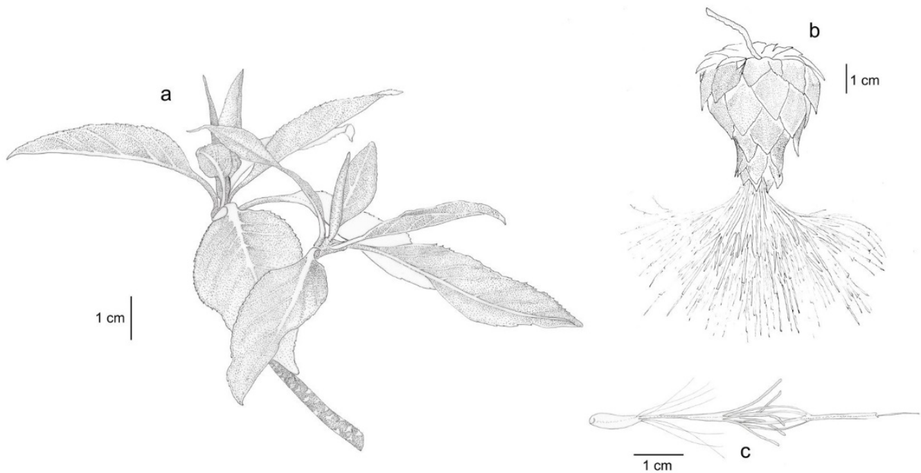
FIGURE 2. Iconography of Centaurodendron schilleri : (a) Branch and leaves, based on pictures of living plants at habitat; (b) Capitula and (c) Floret, based on SGO 170527 (Type). Drawn by Gloria Rojas. / Iconografía de Centaurodendron schilleri : (a) Rama y hojas, basado en fotografías de plantas vivas en el hábitat; (b) Capitulo y (c) Flósculo, basado en SGO 170527 (Tipo). Dibujo por Gloria Rojas.